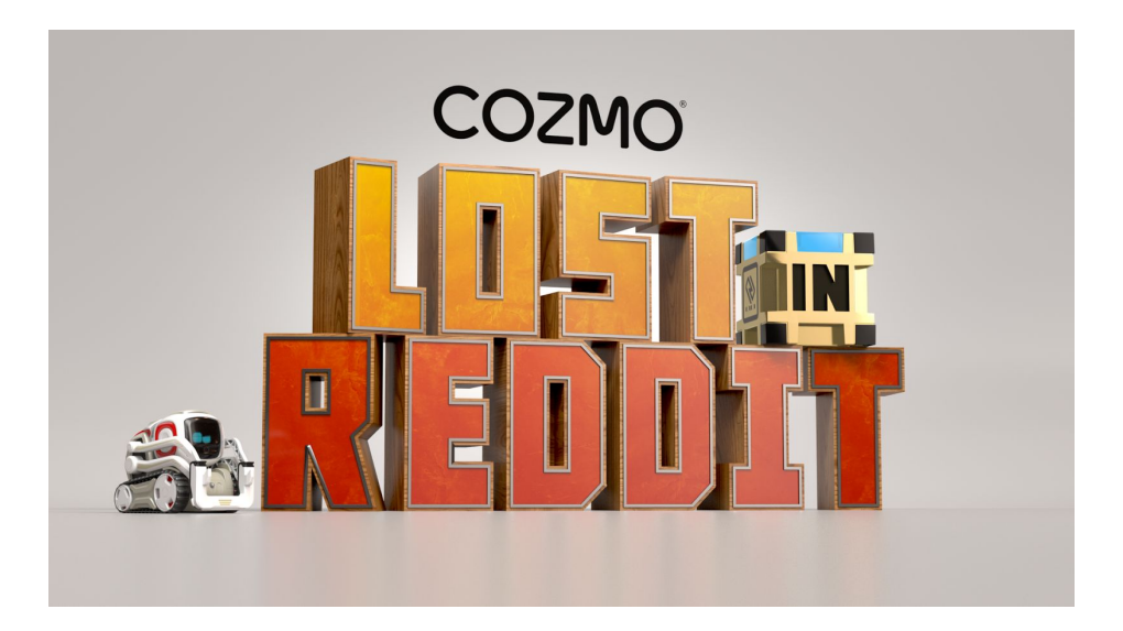
Cozmo Lost In Reddit Fact Sheet